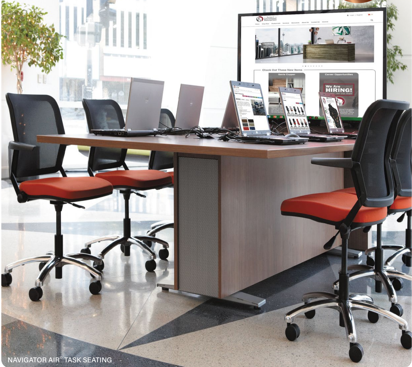
NAVIGATOR AIR ® TASK SEATING