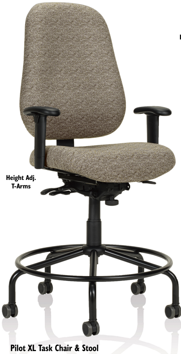
Height Adj. T-Arms