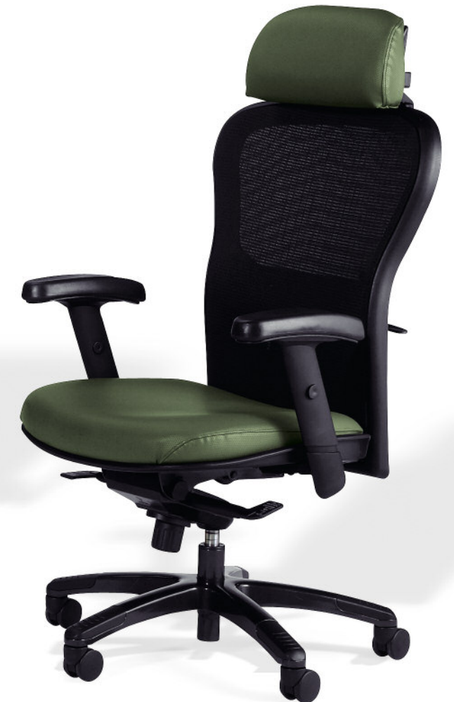
PEDESTAL BASE WITH HEADREST

Heavy-duty, 5-star die cast aluminum base offers built-in molded slip/scuff protectors and durable dual wheel carpet casters.