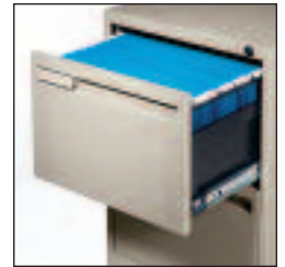
Legal Size - Legal-sized vertical file cabinets are 18" wide.

As strong as it is versatile, the Series XXI vertical file is constructed of heavy-gauge steel and a welded internal box frame. Additional strength is provided by heavy top and bottom bracing and a hidden brace welded to the front of the five drawer unit.