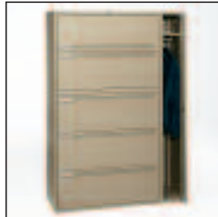
Add-On Wardrobe - The steel kiosk add-on wardrobe is 9" wide, 18" deep and 65-9/32" high to match a five-high Series XXI lateral file.

With so many options and a sharp image, Series XXI filing and storage products are clearly the right choice for today's office.