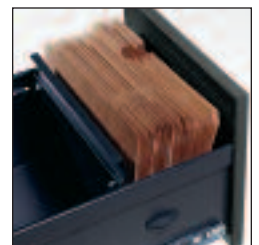
Compressor Followers - User-friendly compressor followers adjust by pulling up and moving forward or backward in 1" increments.