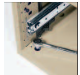
Glide Adjustment - Use a 1/4" socket wrench to adjust glides from inside. The glides allow adjusting from inside or outside and allow accurate leveling of the cabinet.