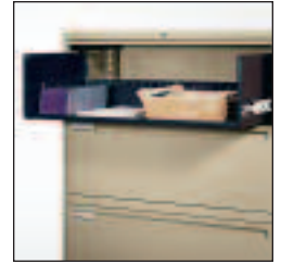
Roll-Out Shelves - Allows for easy access to internal contents.

Featuring ample storage space, Series XXI's lateral files can hold most types of media. Sturdy construction ensures the long life of the product. Choose between preconfigured lateral files and files with 1-1/2" upright spacing for non-standard filing requirements. Drawer configurations include a range of interior options from traditional hanging files to storage for EDP requirements. Notched, heavy-gauge drawer sides can accept legal, letter, and metric-size hanging folders.