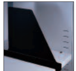
Book End Supports - Supports move across the width of the shelf, accommodating the user's needs accordingly.