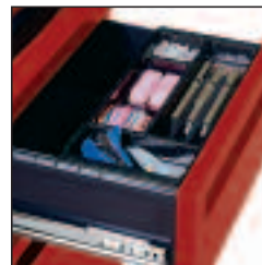
Pencil Tray - An optional pencil tray stores and organizes pens, pencils, paper clips and other office supplies.