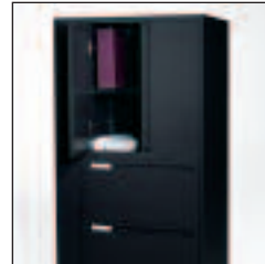
Kiosk Options - Shelving options include the kiosk with hinged doors and the kiosk with open book shelf.