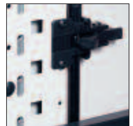
Interlock Mechanism - The patented interlock mechanism promotes safety by preventing more than one drawer from opening at a time.