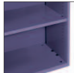
Book Shelf Adjustment - Shelves adjust in 1" increments allowing the user to adjust for specific needs.