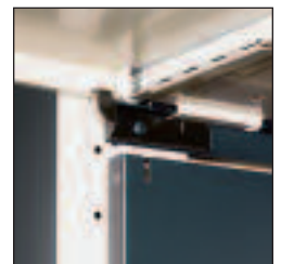
Receding Door Mechanism - The nylon glides prevent metal-to-metal contact, allowing smooth motion.