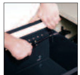
Folder Bars - Hanging file storage is easily managed with field-installable folder bars.