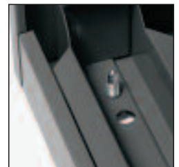
Glide Adjustment - Glides that adjust from inside the cabinet make installation even easier.