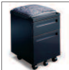
Ped Cushion - A cushioned pedestal top converts some heights of a standard mobile pedestal to a cushioned office side chair.