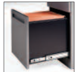
Dividers - Provide back support for side-to-side hanging files. Pedestals feature heavy-duty, ball-bearing slide arm suspensions, allowing for smooth, yet durable operation.