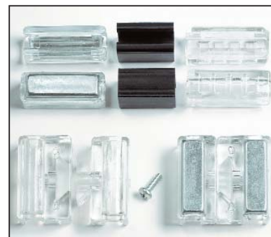
Stainless steel, black PVC, clear polycarbonate, ganging polycarbonate and ganging stainless steel glide options are available for Piper Seating.