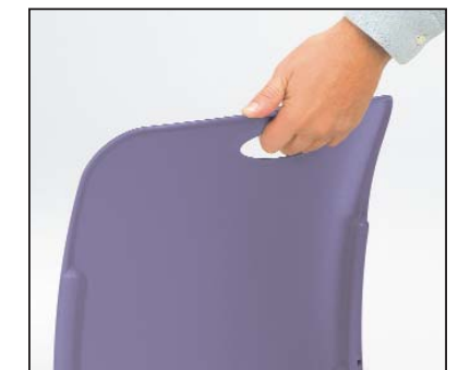
Convenient, built-in handle allows user to move or lift chair and stack with ease.