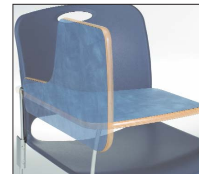
Piper's flip-up tablet arm is available in a right or left-handed model, and is easily field installable.