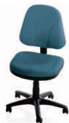
High Back Armless Chair