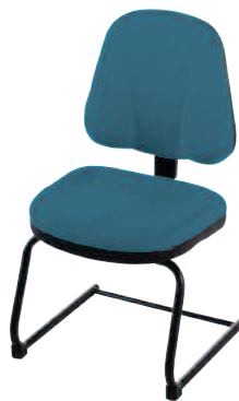
Sled Base Guest Chair