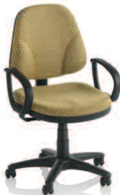
High Back Task with Loop Arms