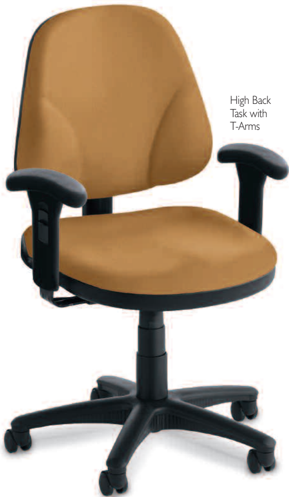
High Back Task with T-Arms