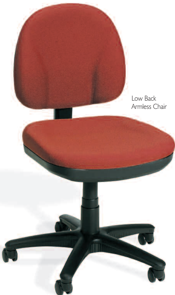
Low Back Armless Chair